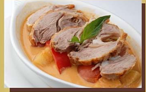
ROASTED DUCK CURRY