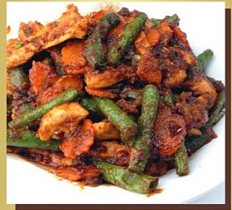
SPICY GREEN BEAN

Stir-fried broccoli, cabbage, carrot, baby corn, green bean, and mushroom in house sauce.